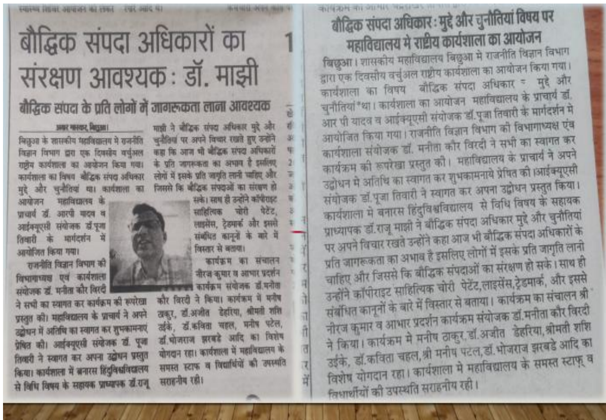
News Coverage in Local and State Level Daily News Papers

Affiliated to Raja Shankar Shah University, Chhindwara (M.P.) 480001