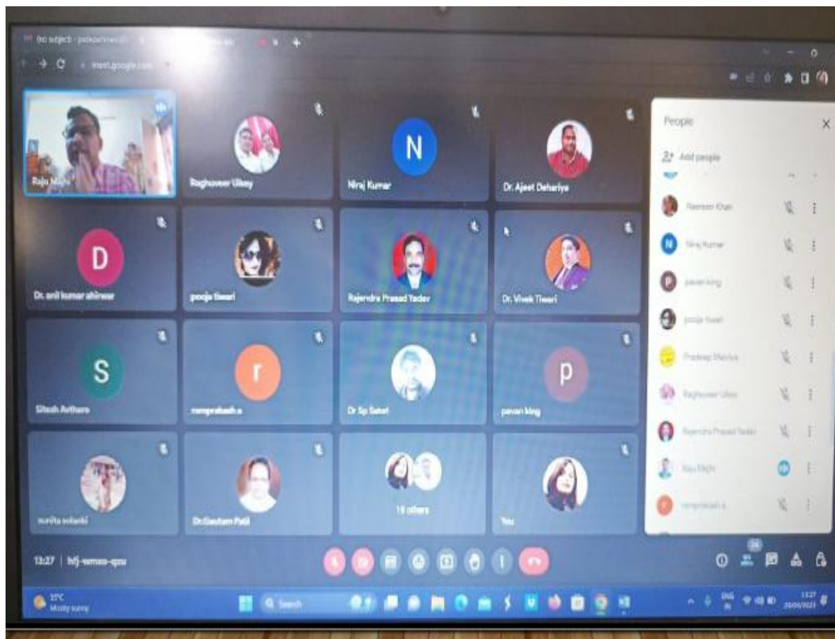
Screen Shot of Workshop Participants

Affiliated to Raja Shankar Shah University, Chhindwara (M.P.) 480001