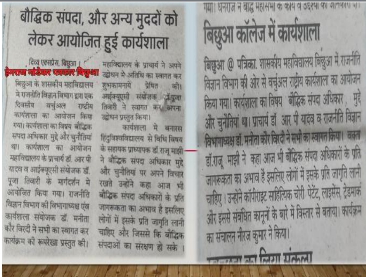
News Coverage in Local and State Level Daily News Papers

Affiliated to Raja Shankar Shah University, Chhindwara (M.P.) 480001