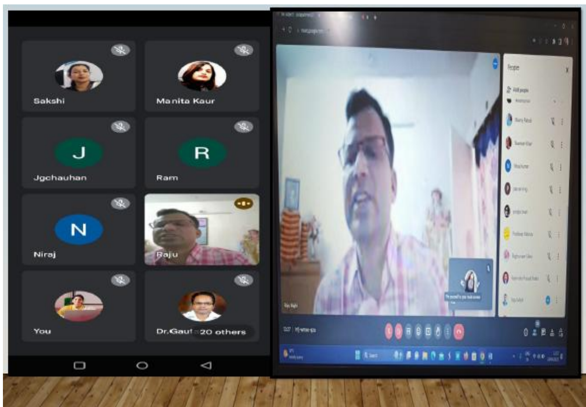
Screen Shot of Workshop Participants

Affiliated to Raja Shankar Shah University, Chhindwara (M.P.) 480001